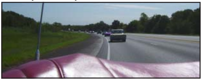
Early Convoy to 50th Anniversary Celebration

At 9 o'clock Saturday morning, led by Geary Grimes, eleven Corvair Houston Corvairs and