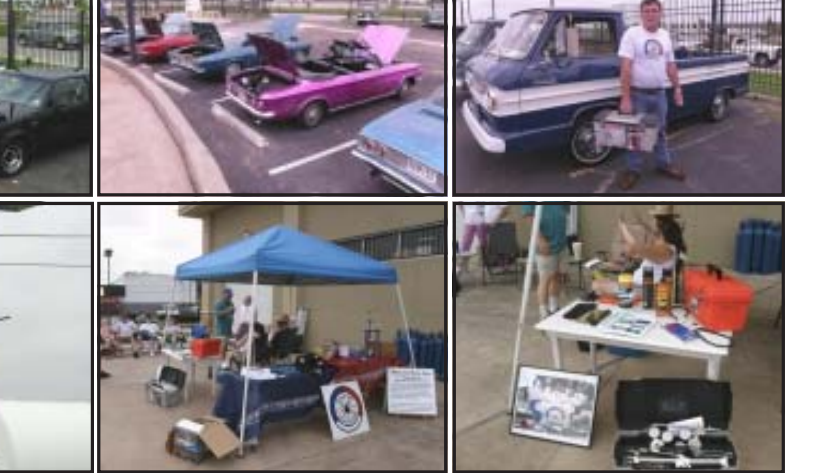
Photographs from the Corvair Houston Club Meeting and Car Show at Advanced Gas

The next morning, Corvair Houston members were up with the sun to work with the "4th annual Ride for Recovery"